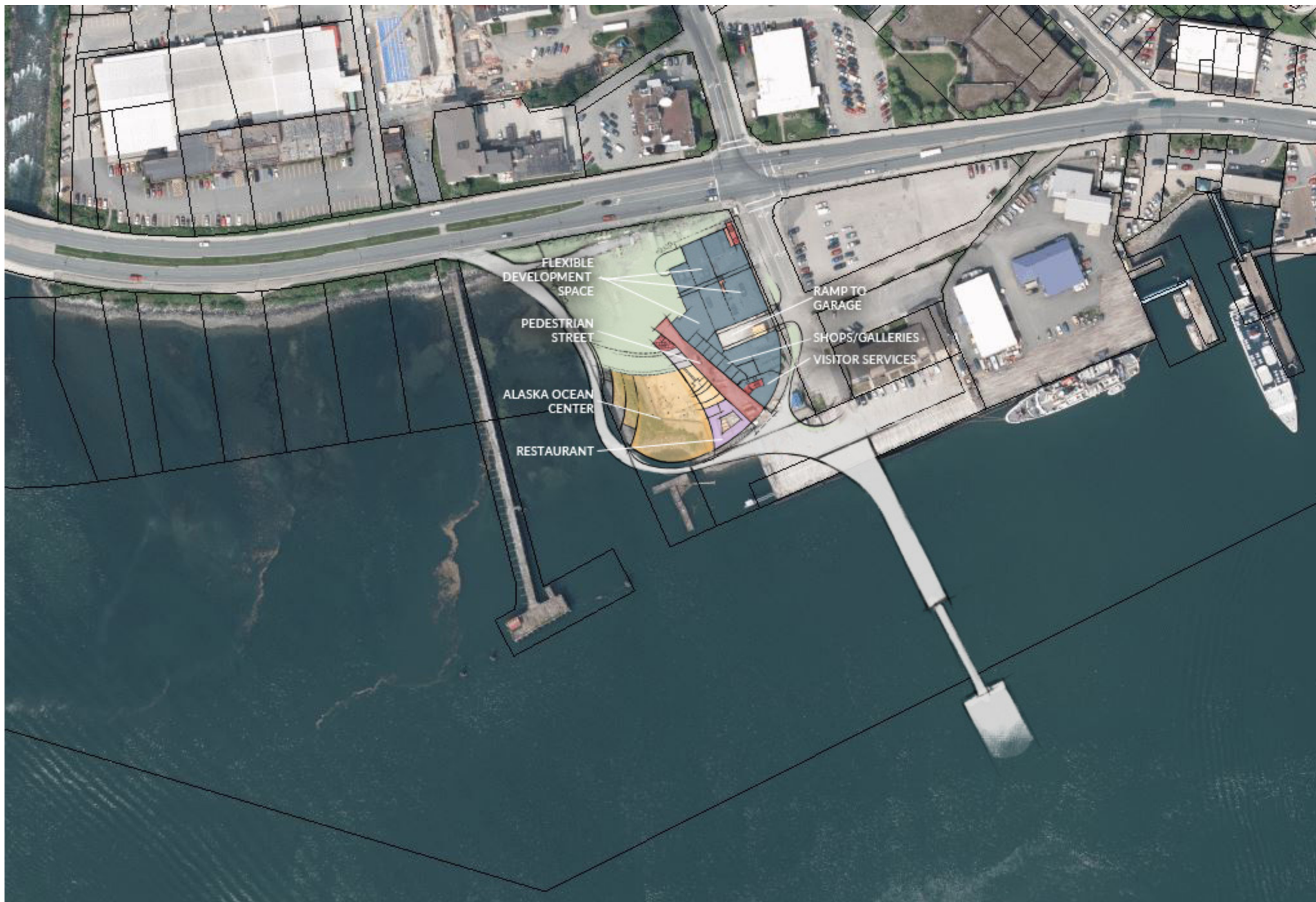
EXISTING CONDITIONS WITH NCL STUDY OPTION